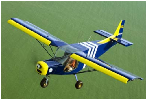
Zenith CH 701