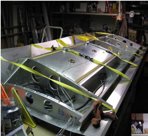
Right wing upper skin ready for rivets.